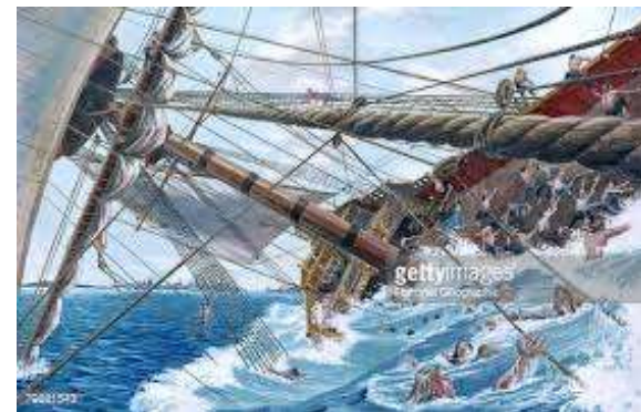
The Vasa 1628