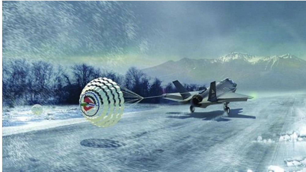
F-35 = $1 Trillion over 50 years

“According to DOD, any analysis of platform effectiveness should include mission, threat, and capabilities desired over the life”