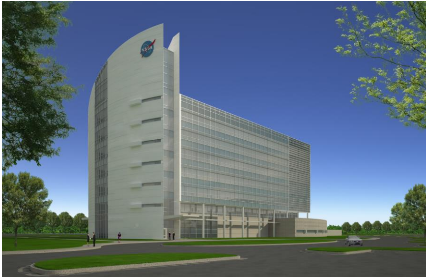
New NASA HQ at KSC A $400 Million Saving over 40 years