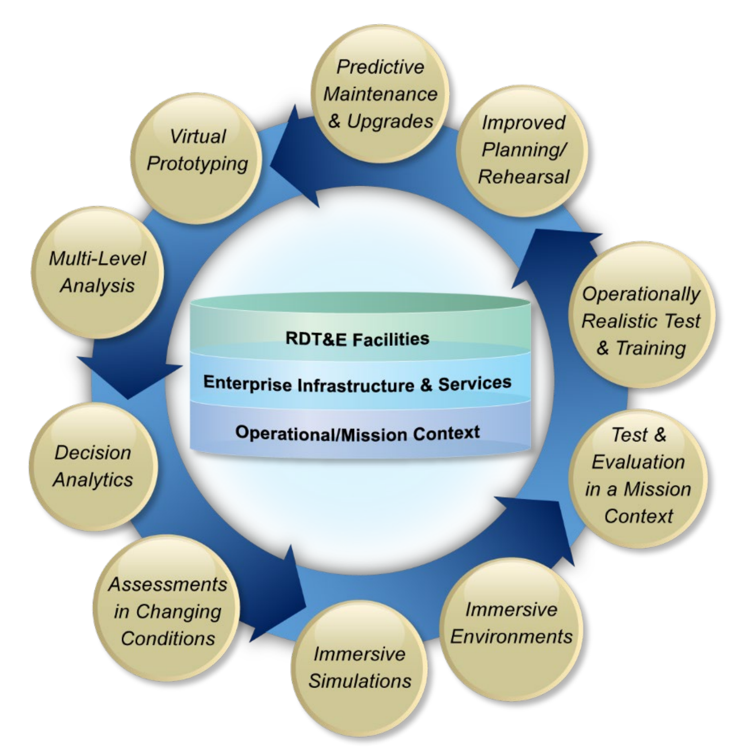
Figure 3. Shared Capability Across the Acquisition Life Cycle

One very tangible benefit of this evolution will be the ability to conduct SoS testing, an essential requirement to support evaluation of concepts, such as Joint All-Domain Command and Control (JADC2), in the context of all-domain operations. Given the